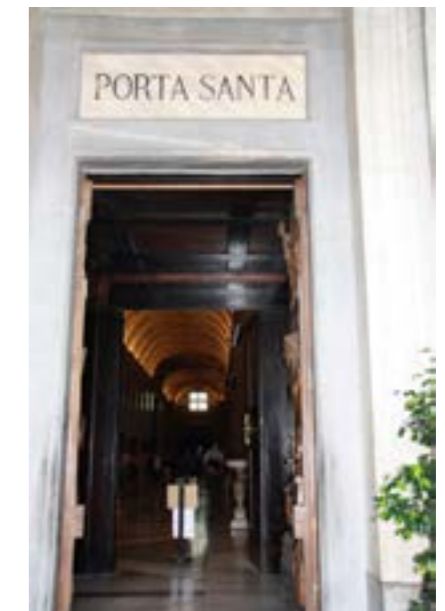
The Holy Door, St. Mary Major, Basilica, Rome

The Basilica of Saint Paul's Outside the Walls