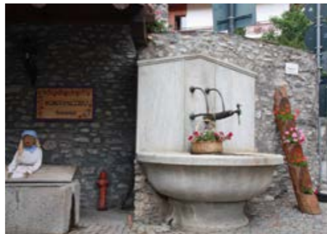
Even puppets welcome visitors.

The above picture was taken outside a quaint restaurant in the old part (Borgo Vecchio).