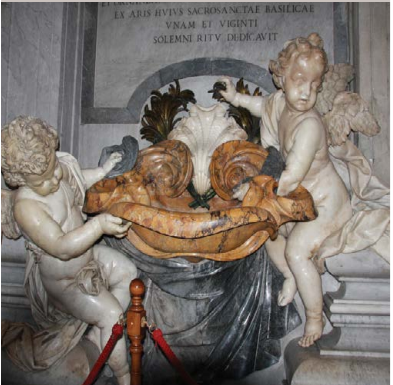
Holy water font, St. Peter's Basilica