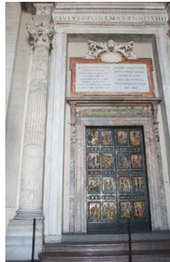
The Holy Door, St. Peter's Basilica, Rome

Approfittiamo anche noi di quest’anno giubilare per metterci in cammino, forse arrivati alla meta avremo imparato a rimodulare la scala dei valori della vita dando a ciascuno di essi il giusto posto e forse a scoprirci anche persone più serene e realizzate.