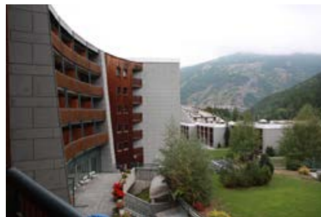
View from Villaggio Campo Smith.

Present day Campo Smith has inherited the legacy of the 2006 Olympic Winter Games and it is possible to tread in the footsteps, or rather the snowboard tracks, and "walk like an olympian". Villaggio Campo Smith also known as Residence Campo Smith (or Apartment Complex) is the actual olympic competitors' accommodation centre. It is located just a stone's throw away from the ski lifts. In particular the baby ski slope and the bike park and adventure park are just metres away.