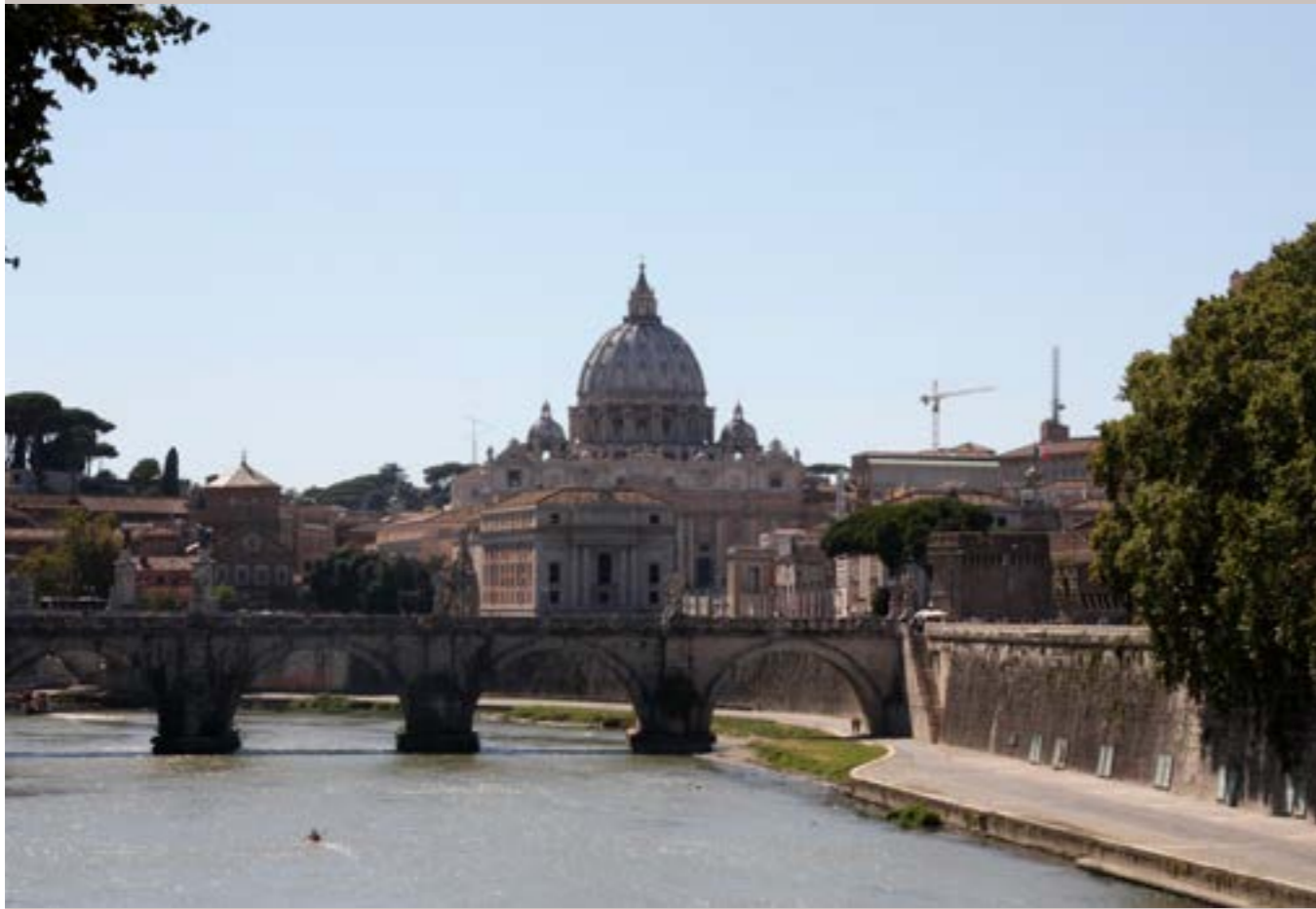
Living Italy Past & Present